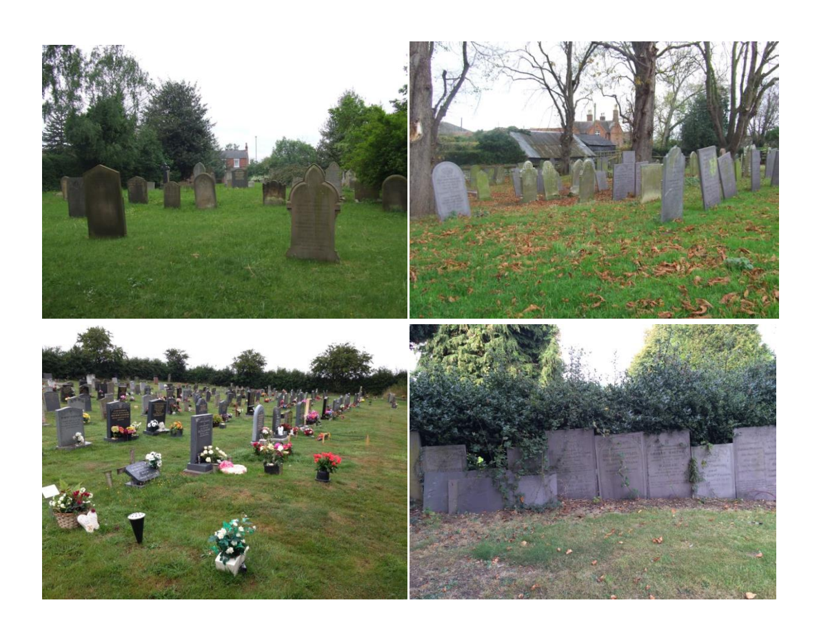
Diocesan Advisory Committee for the Care of Churches